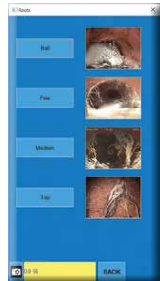
PACP Reference Photos for Defect Codes