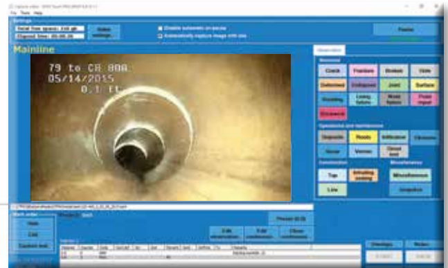
Video Recording Screen

Built-in data verification and validation assures accurate and complete data entry saving time and money.